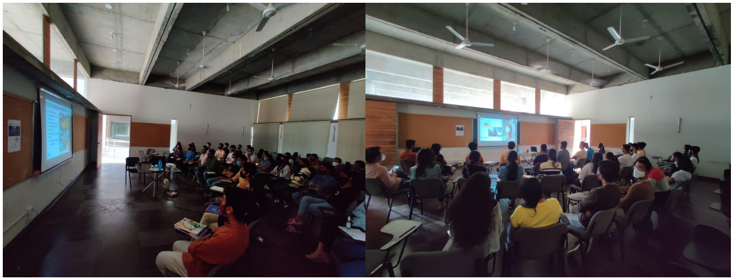
Highlights of the Session - 17th November 2021

SMEFs Brick School of Architecture organised a screening for the students on the first day (17th November 2021) of the students chapter of the Green building congress 2021. It was open to the alumni and current students in batches.